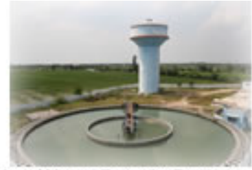
Drinking Water Supply Project